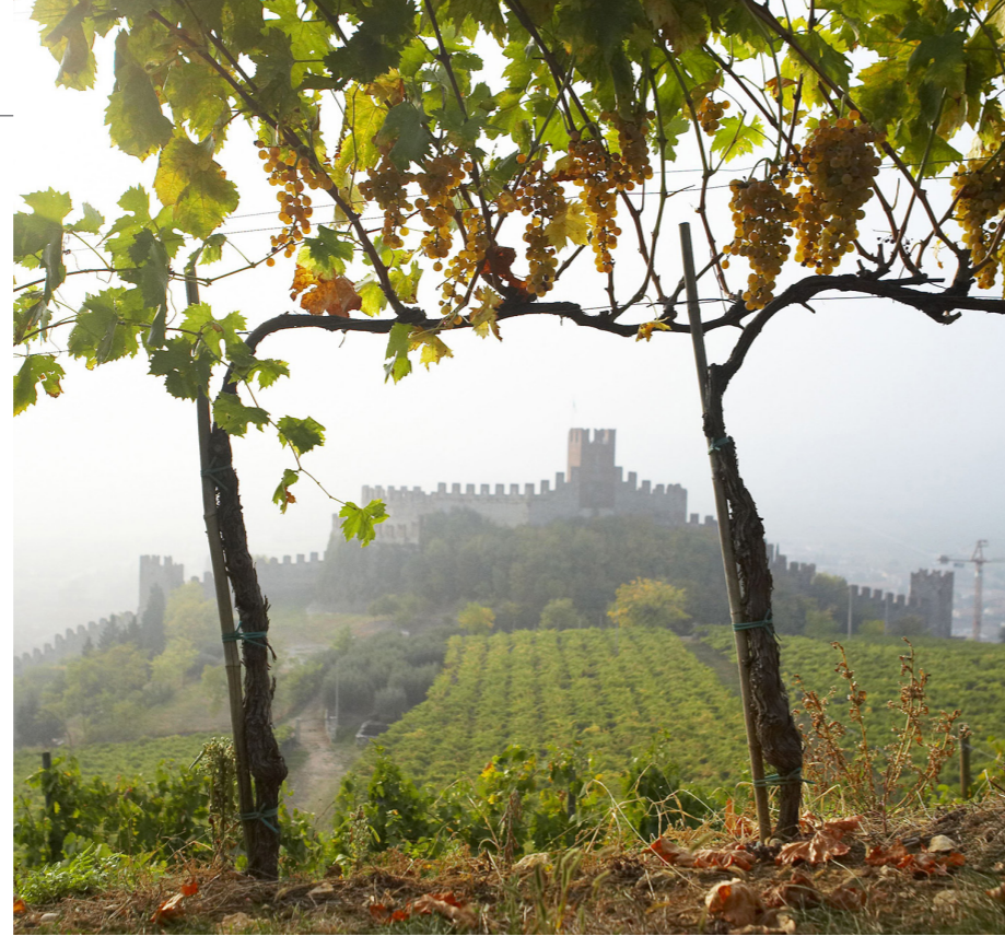
Above: all of Pieropan’s 46ha of vineyards were certified organic in 2015