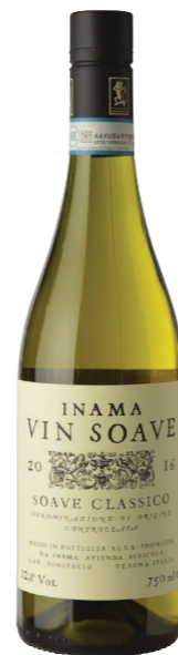
Below: Inama’s Soave Classico 2016

Gini vinifies its Soave cru in oak barrels, most of which are old, and without sulphites (they add a small amount just before bottling). They believe indigenous yeasts result in fewer stuck and better fermentations and, in the absence of sulphites, this results in more refined wines. They emphasise the importance of impeccable hygiene in the cellar to work